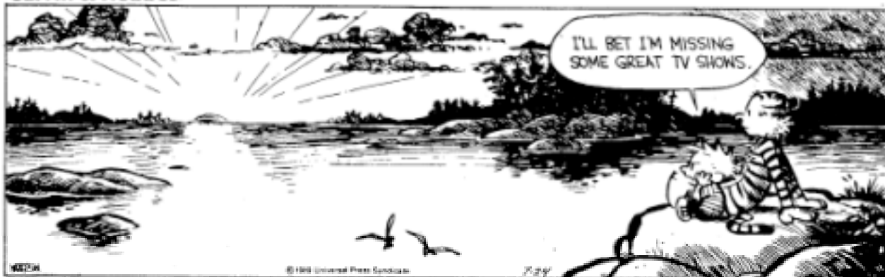
Calvin & Hobbes

Final Exam: Wednesday December 21 st ; 5:30 – 7:30 p.m.